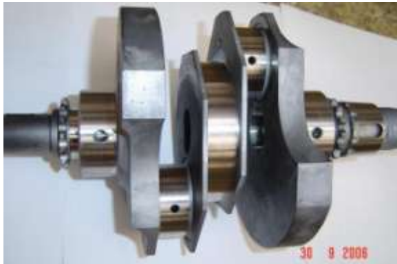
3 Bearing Crankshaft