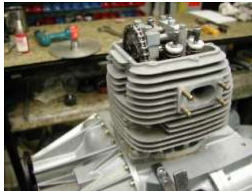
4 Valves Per Cylinder – Overhead Cam